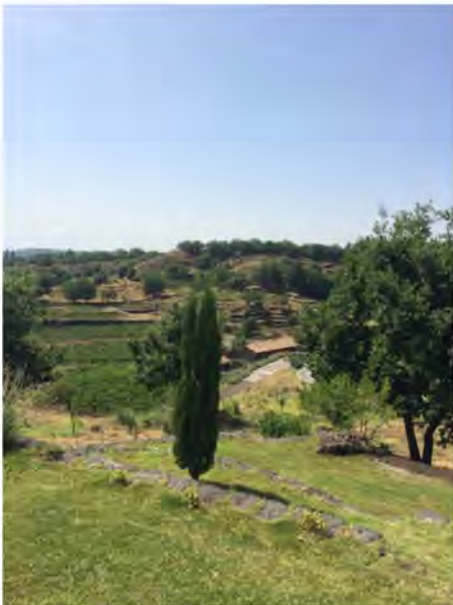
VIEW FROM THE HOTEL

If I've found my favorite little-known hotel, I shouldn't be telling you. But then it cannot be such a big secret as Anthony Bourdain (chef, author and TV personality), John Madden (director of Shakespeare in Love and the Best Exotic Marigold Hotel), and Josh Hartnett (actor, Pearl Harbor) have already plumped for its lava-filled bedrooms. This is Monaci delle Terra Nere, a new-ish (two years old) boutique hotel that's off -the- beaten- lava track in the foothills of Mt Etna, Sicily.