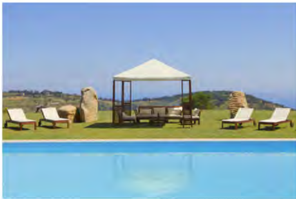
CASALNUOVO IN TINDARI, SICILY

So here we are: August, Sicily, at Casalnuovo in Tindari -- a beautiful villa with majestic 360-degree views and a massive pool. Plus five teens; two with my DNA.