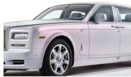
Rolls Royce Unveil Serenity – A Bespoke Phantom with Silk Interior