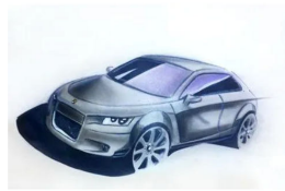
New Ferrari 799 Mugello