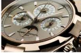
Constantin Craving: Vacherin's Perpetual Calendar Watch