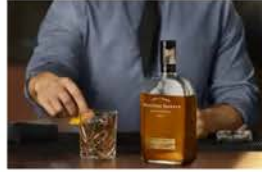
The Disappearing Dining Club Re-fashions the Old Fashioned