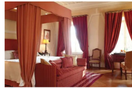
Join The Club: Castiglion del Bosco, Siena