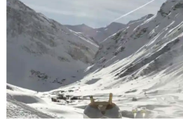
Altitude Slickness – Le Chardon Mountain Lodges