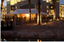
Sir Bani Yas Island