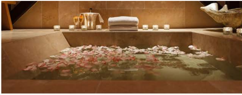
The I Love Amsterdam Suite at Conservatorium

Choose from an abundance of rooms, our favourite being the Grand Duplex Suite for sky-high ceilings and the back pad you'll never have, or I Love Amsterdam if you're at home amidst old beams and a private roof terrace unlocking the Amsterdam skyline. Rooms start at £345.