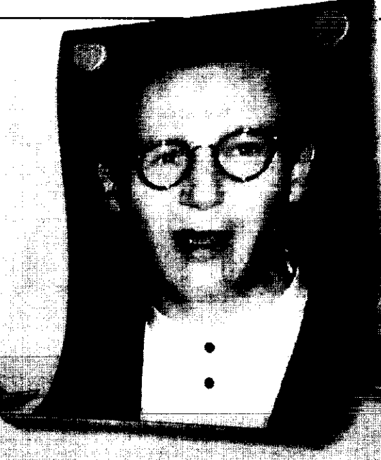
RUGGED: Liam Neeson