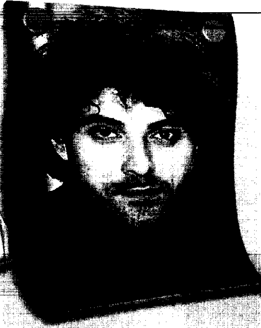
UNKEMPT: Rufus Sewell