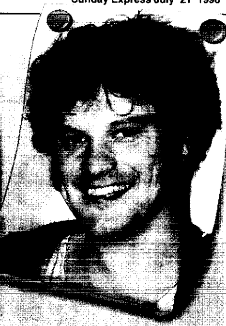
SENSITIVE: Colin Firth