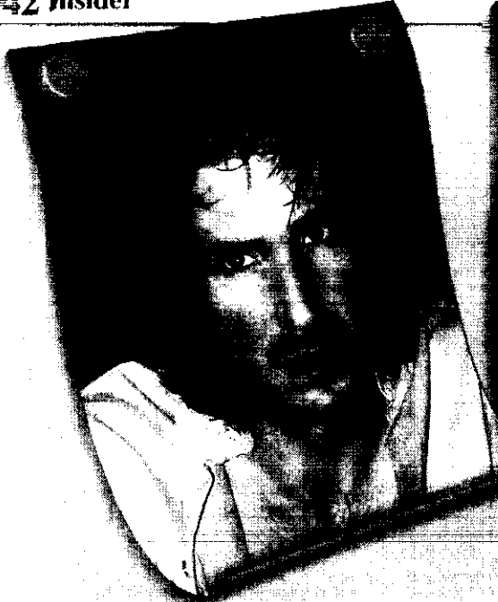
BROODING: Ralph Fiennes