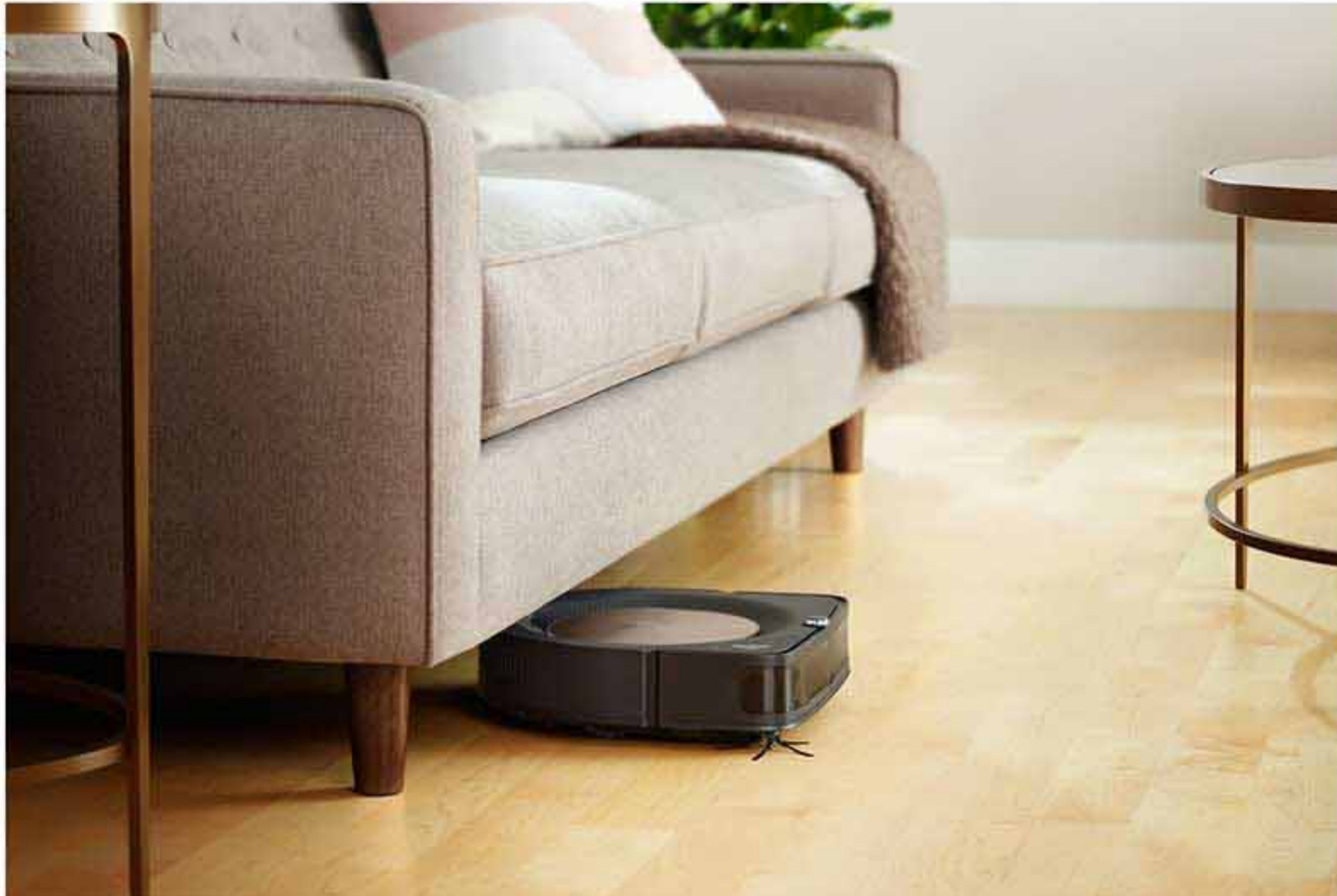
The Roomba s9+

A Wi-Fi connected, self-emptying robot vacuum is a must. A Roomba s9+ to be exact. First, you set everything up on the iRobot Home App, including naming your robot – say, 'Housework-Shy Partner' after your other half, if you wish – all of which is easier than blinking. You'll then watch with your jaw dropped as she/he/they (let's go for 'he') scoots around hoovering with a power forty times the suction of previous generation Roomba vacuums. He'll nip under your sofa – where no cleaner has ever been – to sweep up dust, and disappear into corners to pick up pet hair. (He's just the best at gobbling up dog hair. His advanced 3D sensors also allow him mostly to get deep into corners and along edges, blitzing where moths set up camp.) When Housework-Shy Partner – your Roomba s9+ – detects carpets or rugs, he automatically increases suction to devour dirt from deep within the carpet fibres.