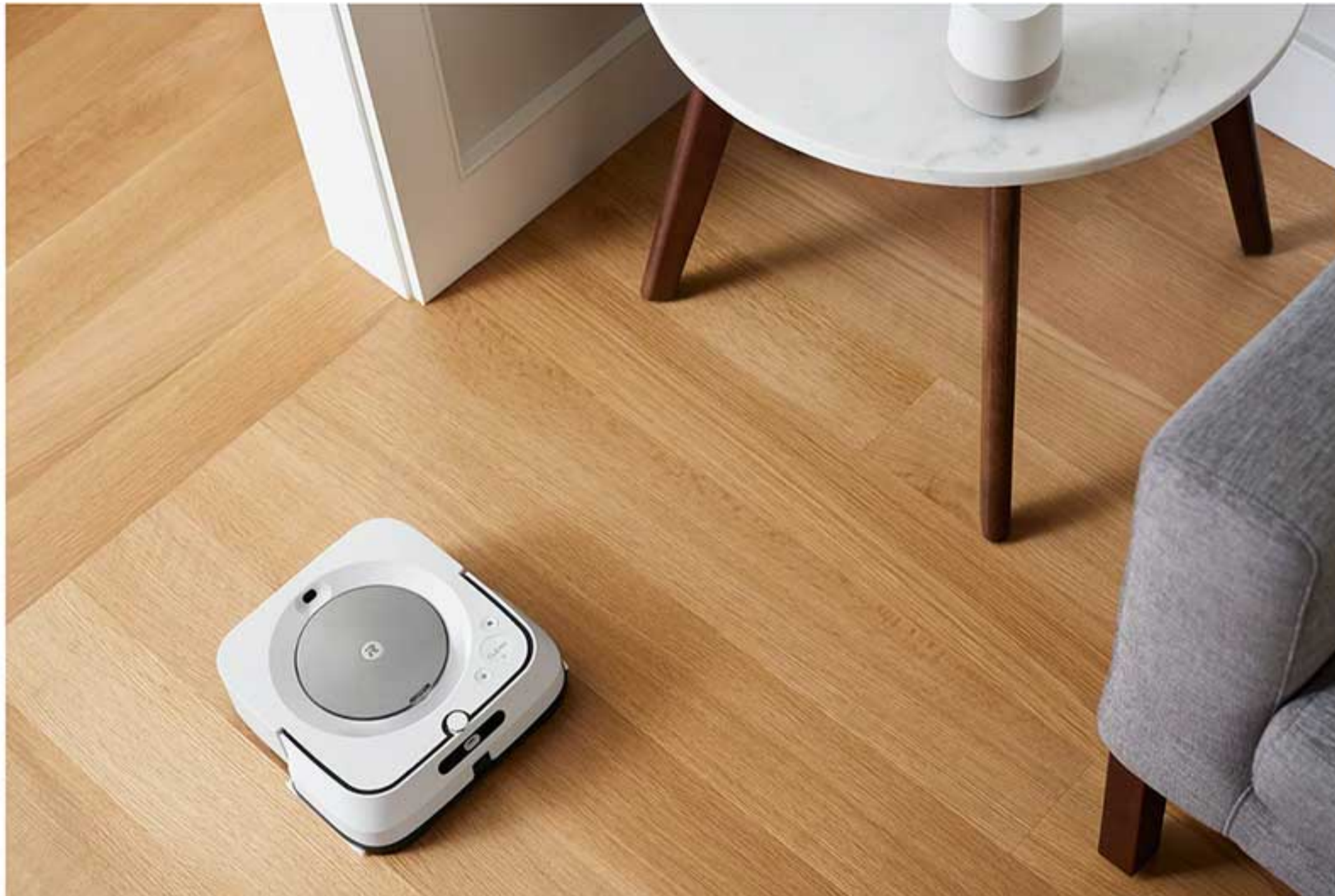
Braava Jet M6

When your iRobot has finished sweeping your floor, you'll be lusting after his colleague, the robot mop. The Braava jet M6 series robot mop for dry sweeping and wet mopping, to be precise. First, you'll set everything up on the iRobot Home App, which is easy peasy even for techie dinosaurs. (You may wish to give him or her or they – the Braava Jet M6 – a name on your app, perhaps 'Helpful Child' as an ironic reference to one of your offspring who never quite manages to help in the house.) After preening and showing off – like some sort of Mr Universe – with his flashing blue and white lights on his 'body', Helpful Child aka the Braava Jet M6, will set off to work on your stone, hardwood or tile floor. You'll watch in gratitude as he jet sprays to loosen dirt then cleans the tiles without missing an inch.