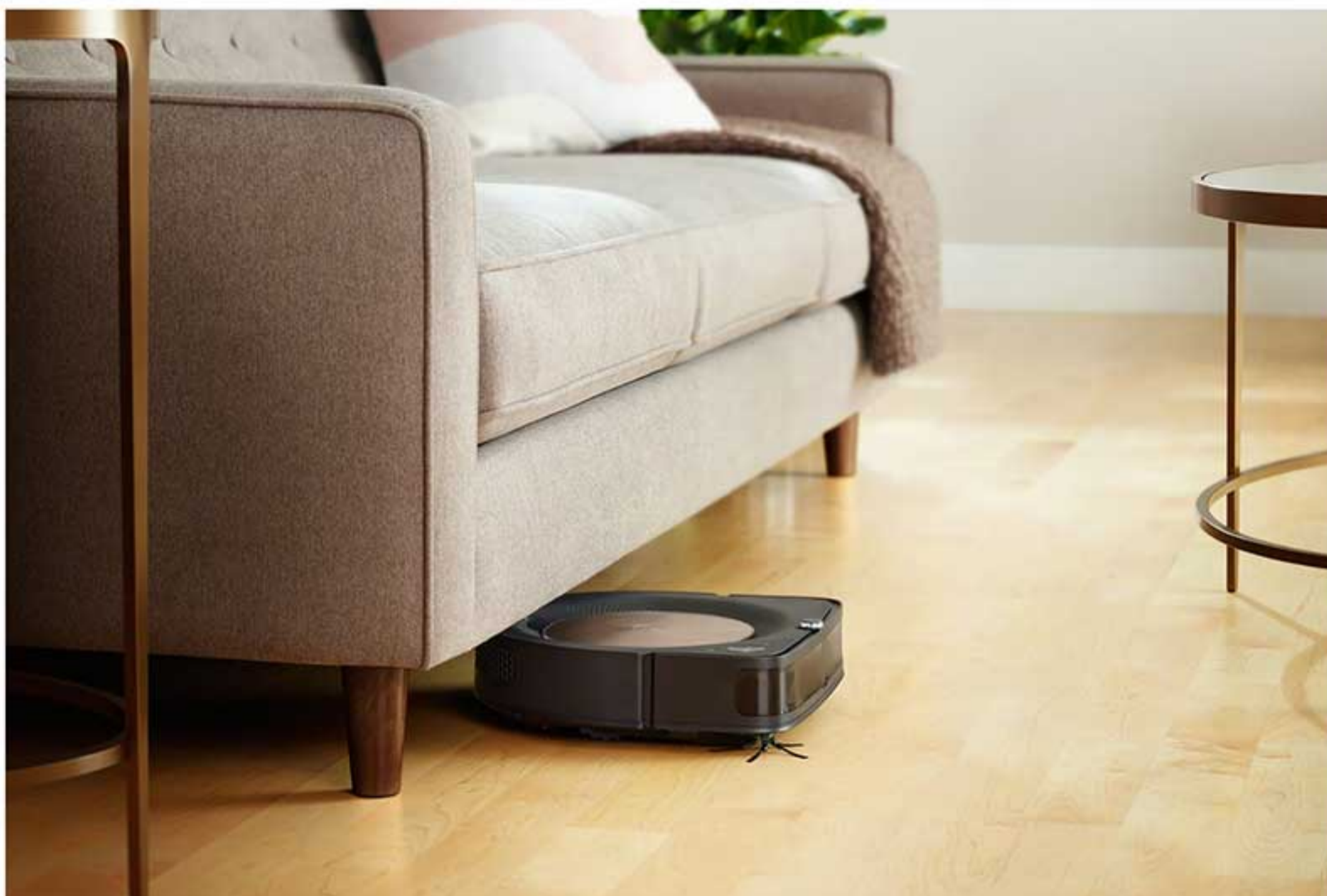
The Roomba s9+

A Wi-Fi connected, self-emptying robot vacuum is a must. A Roomba s9+ to be exact. First, you set everything up on the iRobot Home App, including naming your robot – say, ‘Housework-Shy Partner’ after your other half, if you wish – all of which is easier than blinking. You’ll then watch with your jaw dropped as she/he/they (let’s go for ‘he’) scoots around hoovering with a power forty times the suction of previous generation Roomba vacuums. He’ll nip under your sofa – where no cleaner has ever been – to sweep up dust, and disappear into corners to pick up pet hair. (He’s just the best at gobbling up dog hair. His advanced 3D sensors also allow him mostly to get deep into corners and along edges, blitzing where moths set up camp.) When Housework-Shy Partner – your Roomba s9+ – detects carpets or rugs, he automatically increases suction to devour dirt from deep within the carpet fibres.