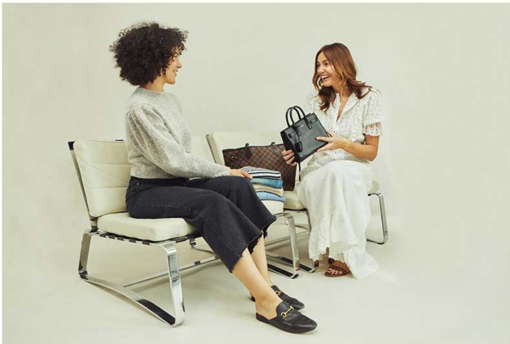
Sign Of The Times