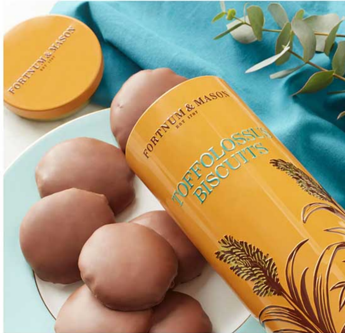
Fortnum & Mason

If you too were raised having half-term treats in Fortnum & Mason's eating Knickerbocker Glories, this one's for you. Everyone's favourite store has recently teamed up with high-end delivery app SUPPER to launch a super-fast home delivery service – a specially curated selection of fine and artisan fresh foods and in-store products whizzed to you in under two hours. If you have a caviar emergency, you can get 50 grams of Oscietra delivered in (maximum) 120 minutes, 119, 118... But who's counting? There's no box set that isn't improved by a Fortnum's towering tin of Toffolossus biscuits, truffle crisps or a cave-aged cheddar wedge. And no television programme that's not made better by the speedy delivery and even speedier consumption of a traditional Scotch egg with its yellower-than-yellow-and-delightfully-runny yolk. Or by the potted Welsh Rarebit which comes in a beautiful ceramic pot (which you keep afterwards for paper clips) and tastes sensational, just £13.95 for 250 grams. All washed down by vintage Dom Perignon, a bottle of sparkling tea, or the Royal Tea blend.