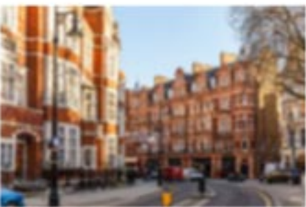
5 OF THE MOST EXCLUSIVE MEMBERS' CLUBS IN THE WORLD