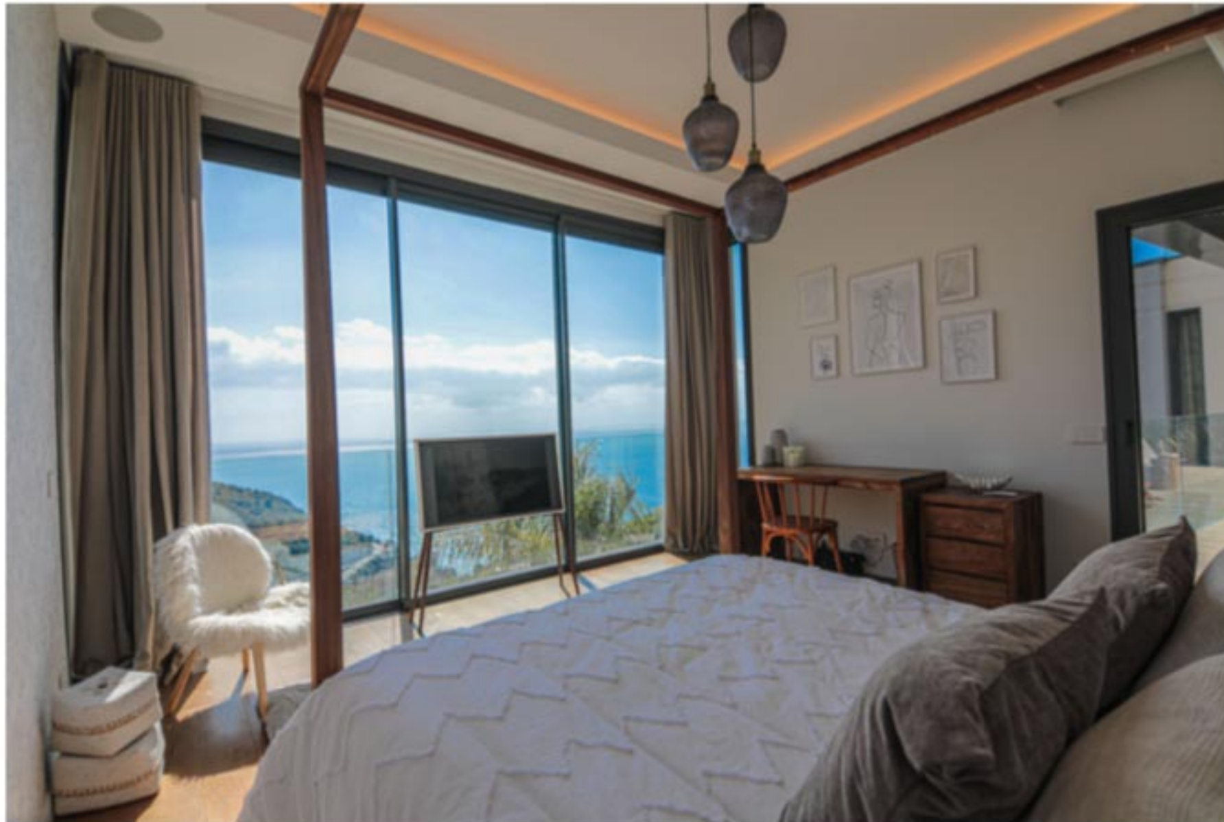
Interior of villa