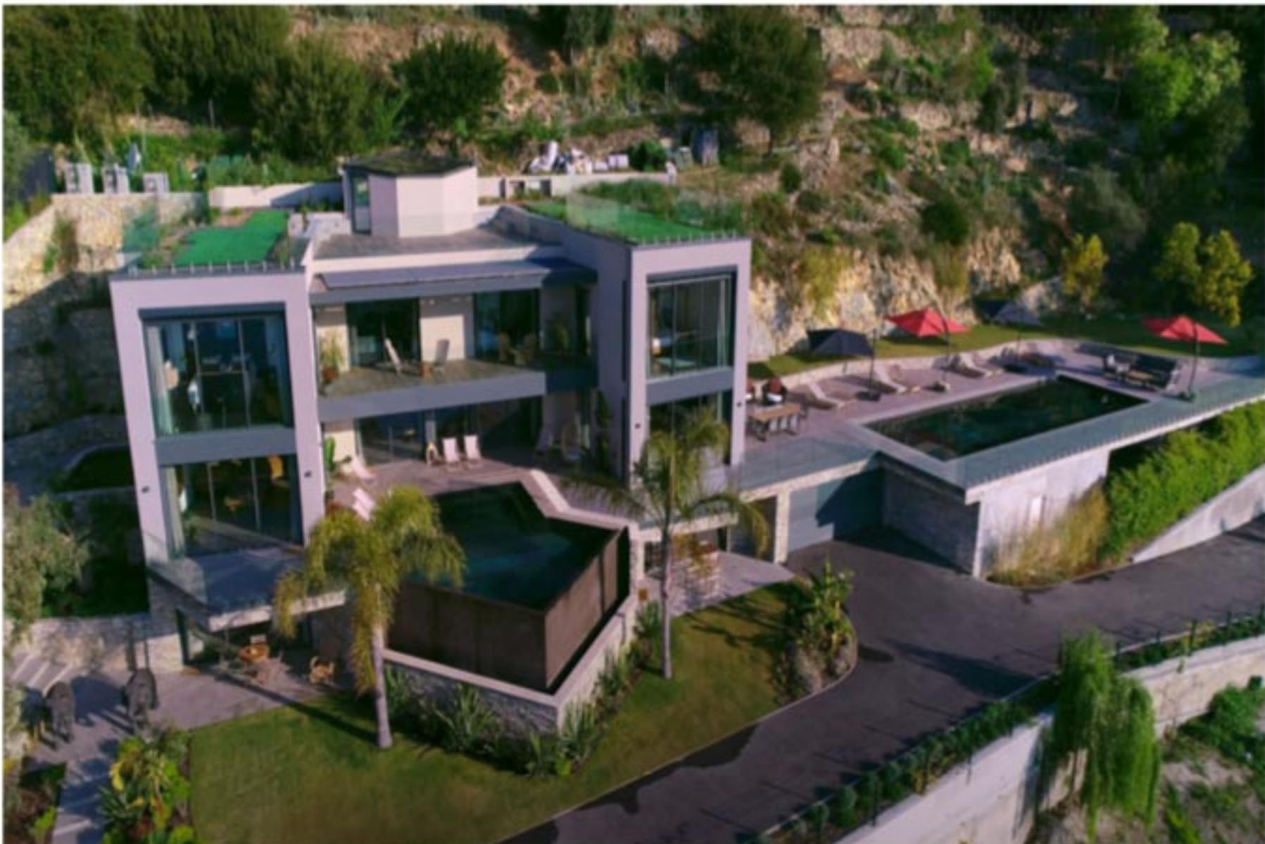
Prestige Villa on Sea

Everyone wants an experience these days. The way people travel has changed forever. So why not search the region for accommodation on Airbnb? You'll be dizzy with excitement at the site's new categories — from 'Amazing Views' to 'Design', 'Countryside' and 'Historical Homes'. (Globally, who wouldn't want to wake up in a Frank Lloyd Wright, lounge around in a Le Corbusier or brew their morning coffee in a once-radical design by Ricardo Bofill? And don't let's get started on the possibility of staying in windmills, shepherd's huts, trulli and houseboats...) But Eze comes into its own in the 'Amazing Pools' category. There are houses with infinity pools with views to die for, where you sip your apéritif while also drinking in the Med. And period villas and apartments that boast style and (almost) guaranteed sunsets. You can get a luxury villa in Eze with pool, terraces, and summer kitchen to sizzle your Provencal rosemary and lamb on. There's Villa Serangen, located between sky and sea (£1851 a night) and just 15 minutes from Monaco. Villa Vue Sur La Mer (£933 a night), just five minutes from the beach and with a wraparound balcony with views of Eze Bay. Just to mention two. airbnb.co.uk