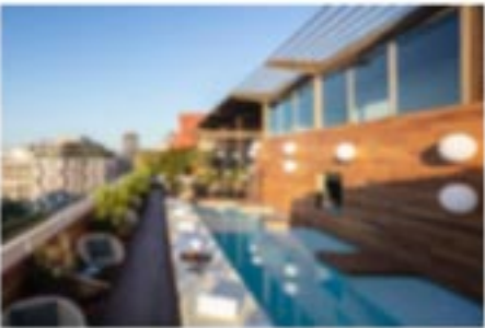
REVIEW: SIR VICTOR, BARCELONA