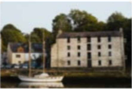
HOT NEW UK HOTEL OPENINGS TO KNOW IN 2022