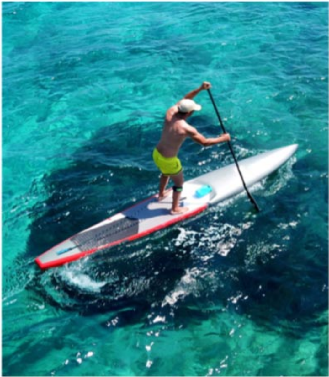
Paddle Boarding Experience