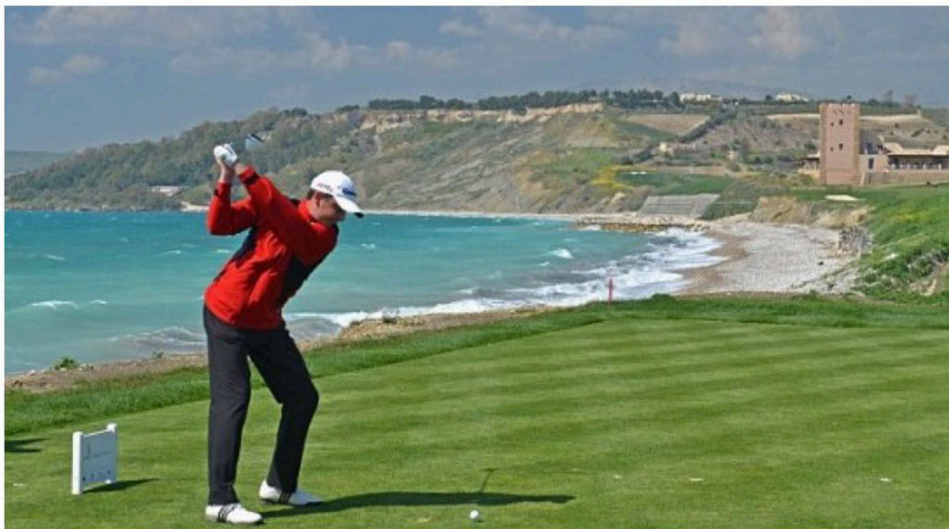
The stunning scenery is just one of the Verdura Golf and Spa Resort's attractions