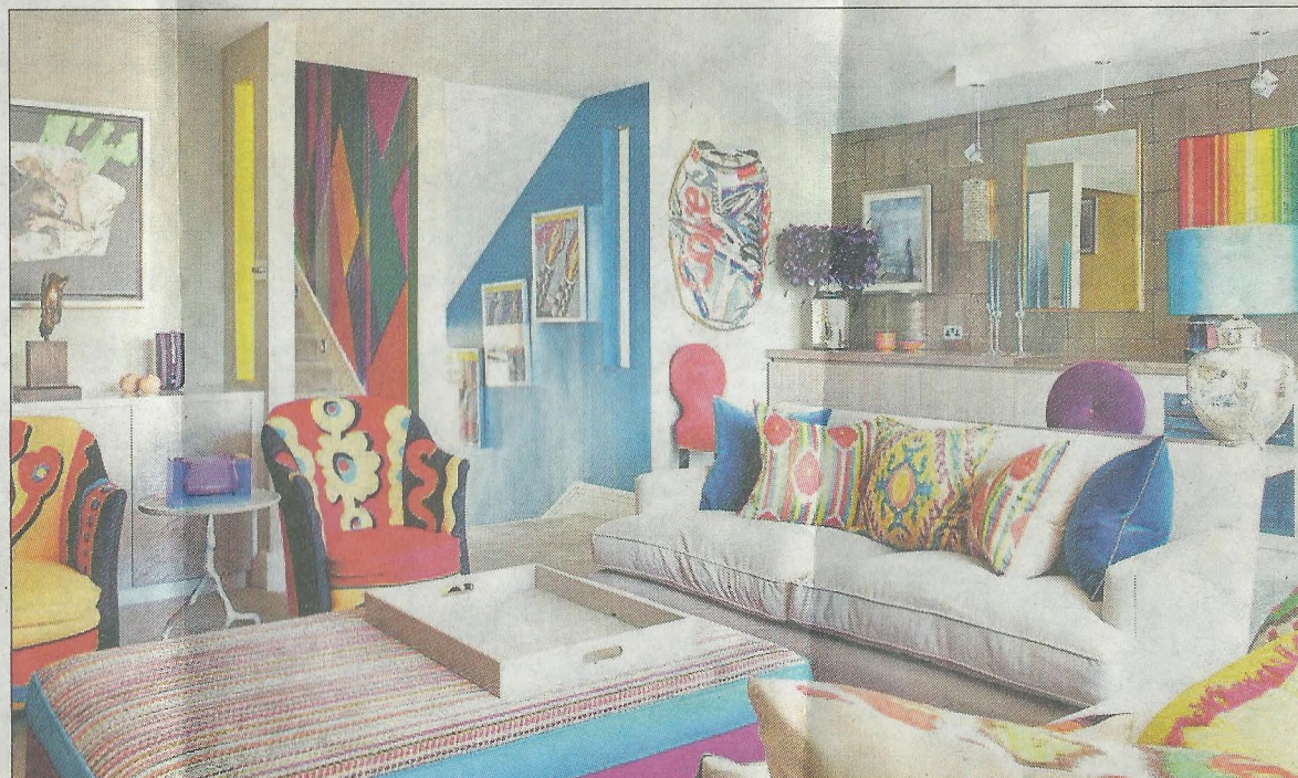
Colourfest: florals, rainbow shades and luxury fabrics pepper Emma Deterding's welcoming sitting/dining/kitchen space