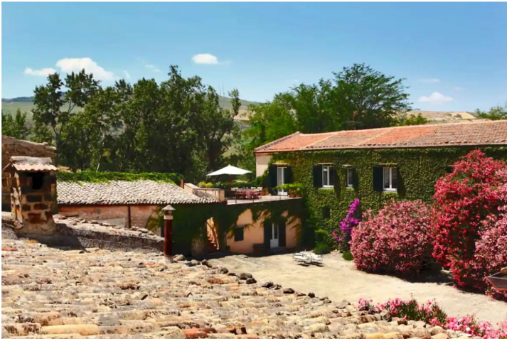
Fattoria Corleonese, Sicily.