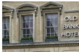
Oxford Hotel Banks Award